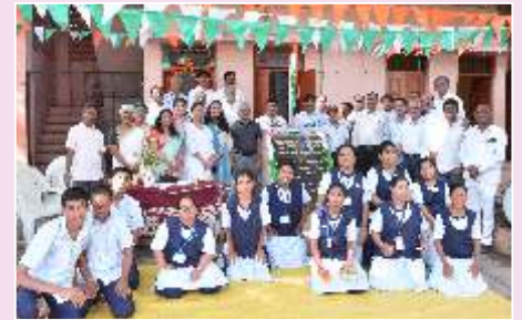
15th Aug. - Independence Day at Rotary Redcross Swagati School