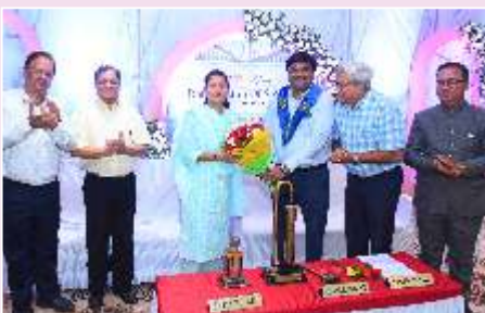
25th Aug. - New Members Induction Ceremony Chief Guest MP Rtn. Pranititai Shinde