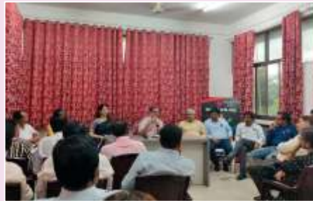
24th Aug. - New Member Orientation