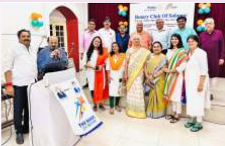
16th Aug. - Patriotic Songs