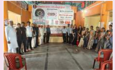
24th Aug. - Cancer Screening and Awareness Camp at Killari