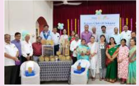
09th Aug. -Celebration of District Awards