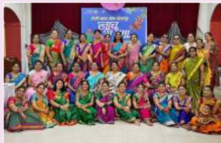
23rd Aug. - Naach Ga Ghuma Program for Anns