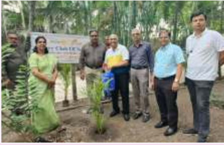
04th Aug.- Tree Plantation at Chandak Garden