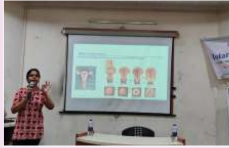
06th Aug. - Cervical Cancer & HPV Awareness Mangalwedhekar Institute of Management