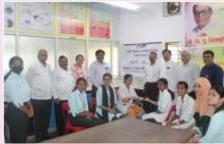
13th and 14th. Aug. - HB Testing Camp at Shivdare College